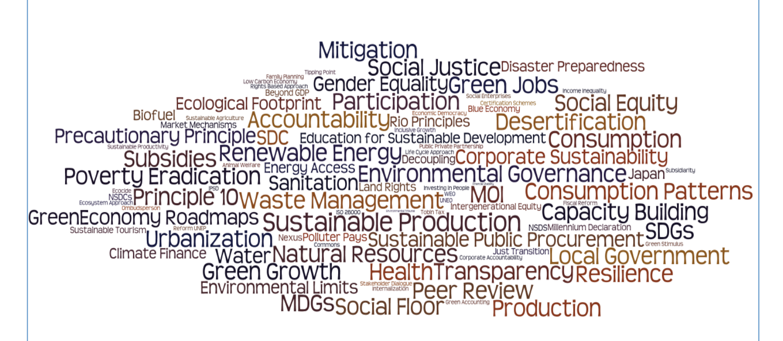
Figure A - Zero Draft Submission Wordle

The rest of Section 2 presents Stakeholder Forum's analysis of the database and our findings. As stated above, it is hope that by making all of this information publically available it can be used to improve the outcomes of Rio. It aims to facilitate this by identifying where support is needed most and by allowing cluster of mutually interested parties to form around initiatives and begin offline discussions on different issues to bring well-informed and mutually agreed ideas back to the formal negotiations. An example of what this process might look in practice is outlined below: